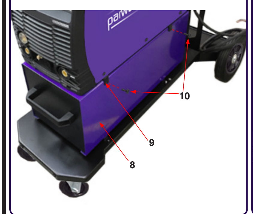
FIG 4 - Assembly of Machine to Drawer or W/Cooler